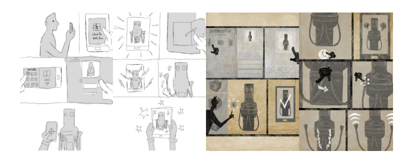
Storyboards for the game tutorial animation.

A few months after the MOJO event, the game had a final test. This test involved 30 persons, 19 male and 11 female users/players. This test had the purpose of finding if the users/players felt a deeper connection with the Gower-Bell Telephone in terms of interaction. We also wanted to find if this game is a possible solution for acquiring knowledge about this object. In order to know if the interaction was good, a usability test was done. The usability test used was the UEQ.<sup>18</sup> This test evaluates the game in six dimensions, attractiveness, perspicuity, efficiency, dependability, stimulation and novelty. According to the authors of the UEQ, a positive value is > 0.8 for the mean, and if we watch the mean results, every scale was positive however, the perspicuity had a standard deviation of almost the mean value, and the confidence interval shows that this scale has a lot of values < 0.8. But the other results were good, the best one was the attractiveness, stimulation and novelty, which means that the users liked this game a lot.