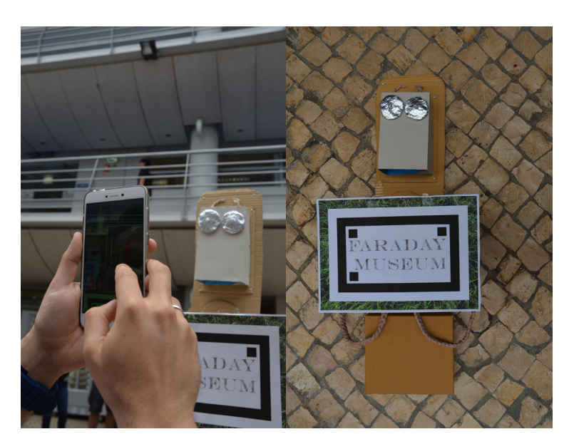
Cardboard replica of the Gower-Bell telephone for usability tests at public game exhibition, May 2018.

Finally, we did the third game challenge and worked in code optimization like reducing the number of calls of certain expensive methods per frame. We proceed with visual optimization like having big images with different images inside it or having different images for each different image, in order to reduce draw calls, making a shadow catcher to simulate shadow in the museum wall. Since this is an augmented reality game, the 3D object will be overlapped with reality, since the real object is in a museum wall, this will turn the experience even more realistic.