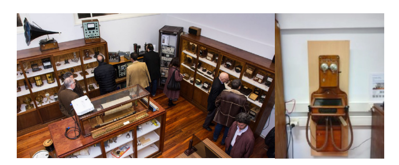
Fig. 1 One of Faraday Museum's Rooms and Gower-Bell telephone.

Location-based augmented reality game demonstrated by (Rubino 2015) is a game where the player plays pieces of the play differently if she/he is located in different museum rooms. Finally, we can quote the example of an augmented reality game teaching about boats inside the naval museum of Ílhavo (Costa 2013). This game detects if the player is at a specific location when she/he points the smart phone's camera to the correct place in the museum in order to show info about boats.